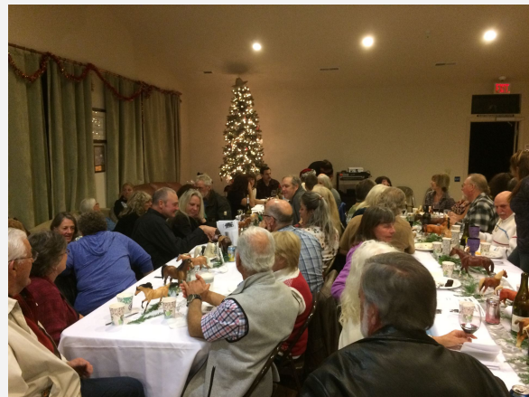
Sharing a Potluck FEAST!